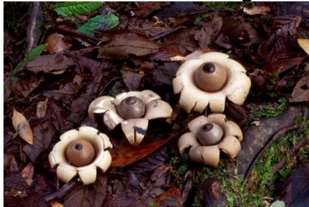
An Earthstar fungus