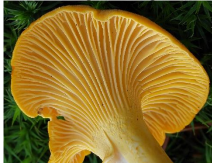
A fungi with gills