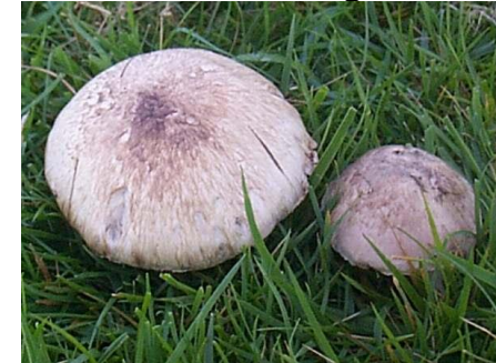
A white fungus