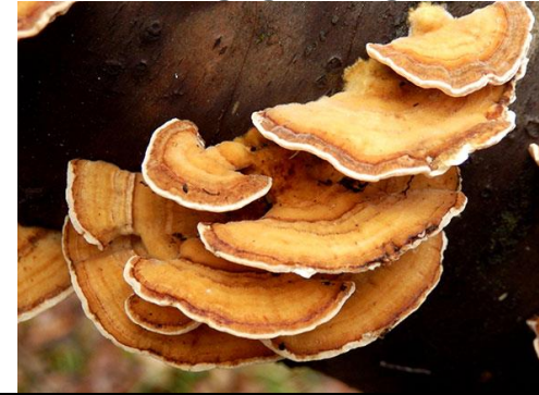
Bracket fungi growing on wood