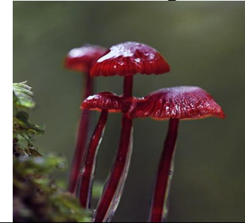
A red fungus