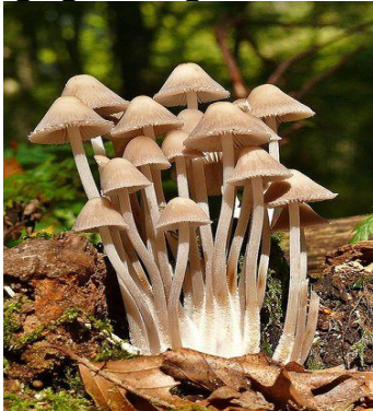
Fungi growing in a cluster