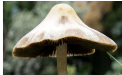
A mushroom that looks like an umbrella